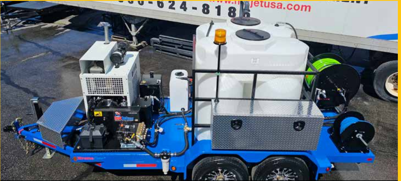
Tank Option: Twin 300 Gallon for a Total of 600 Gallons (Vertical Tanks)